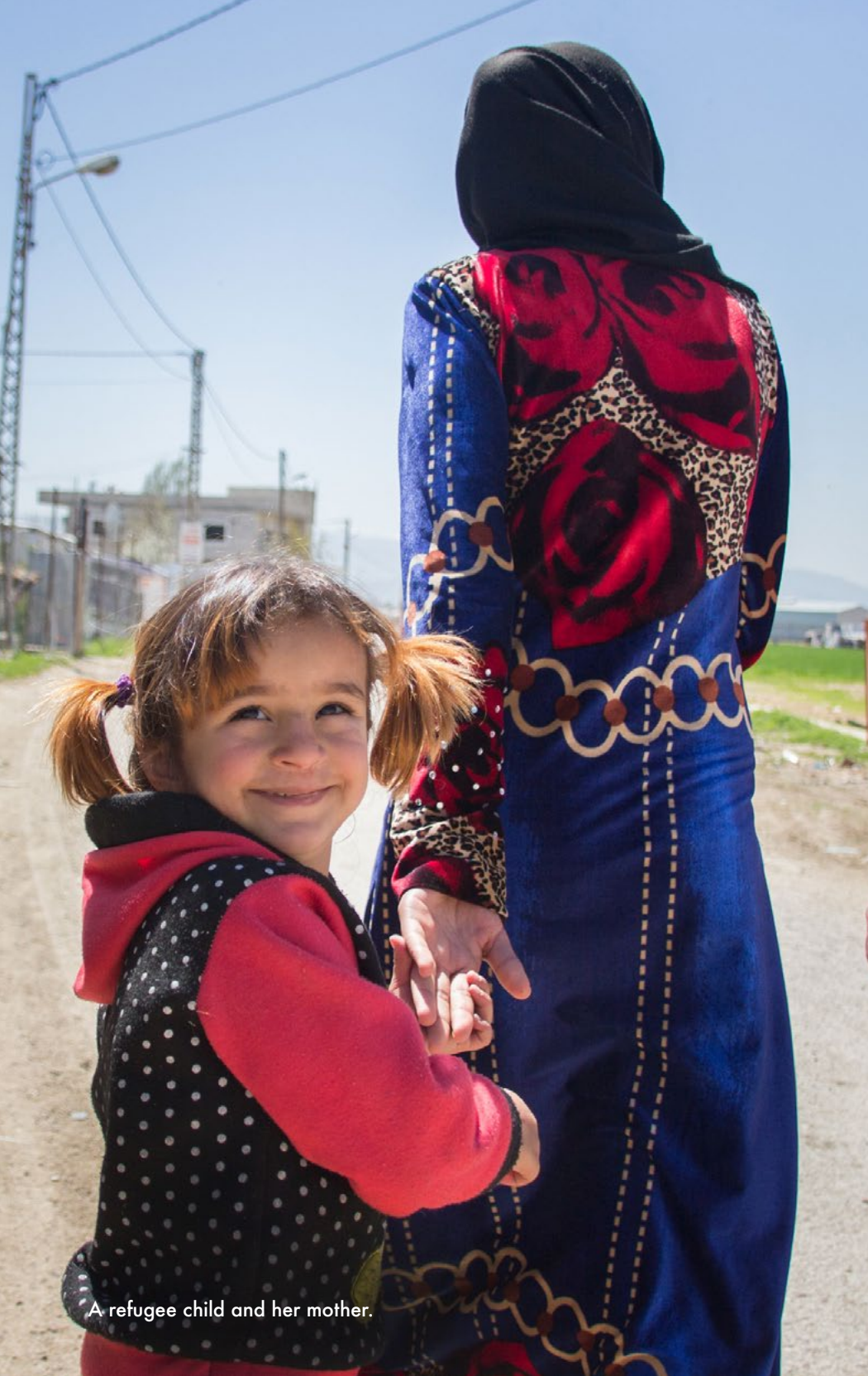
A refugee child and her mother.